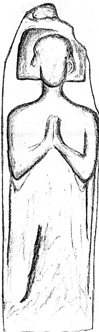
Plate 20 Sketch of the 14th Century Civilian Effigy at West Lydford.